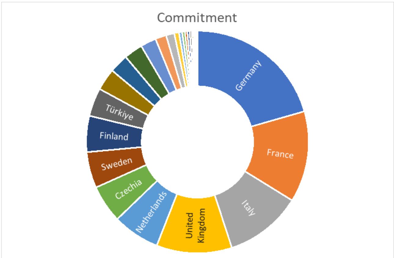
Figure 3. Relative commitments of the participating countries.

The relative National Commitments of the 23 countries participating in the Metrology Partnership are shown in Figure 4.