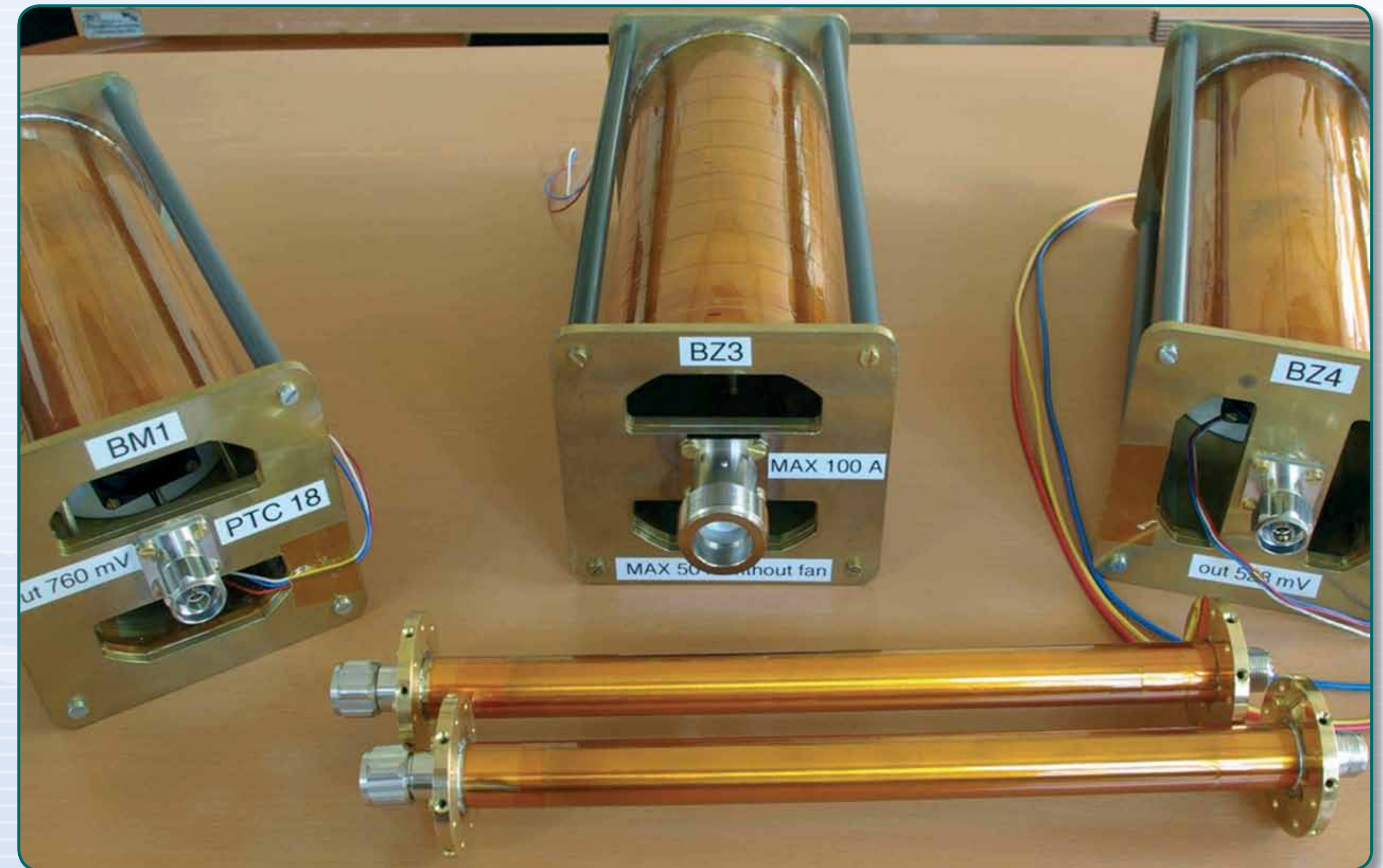
Precision High Current Shunts.

The resulting data was processed using algorithms, producing the complex range of power quality metrics used by industry. The waveforms of interest are continuously changing as the electricity demand changes - this required the development of new waveform transforms to analyse these complex waveforms.