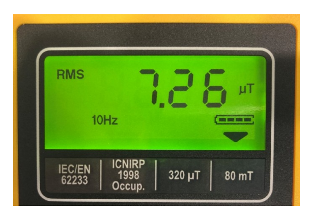
c) 80 mT – Low Range*