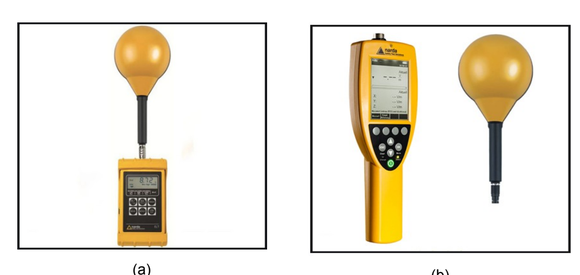
(a) (b) Figure 1 . The photo of the travelling standards, a) ELT 400, b) HF3061 with NBM-550

The travelling standards will be supplied by TÜBİTAK UME. These standards were chosen for their high accuracy and stability over time. The photos and the general specifications of the travelling standards are presented in Figure 1 and Table 1 respectively.