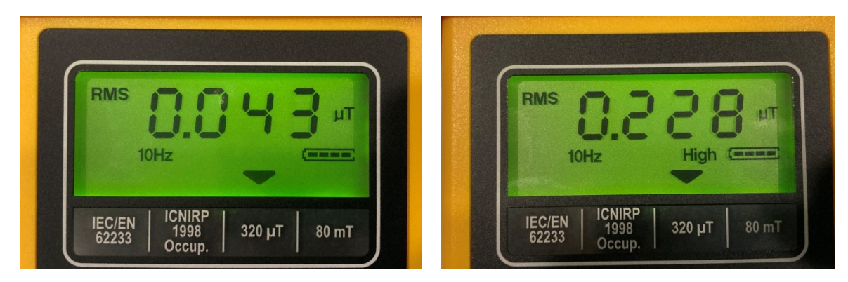
a) 320 µT – Low Range*