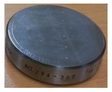
S/N: 294-367, 300 HBW2,5/187,5