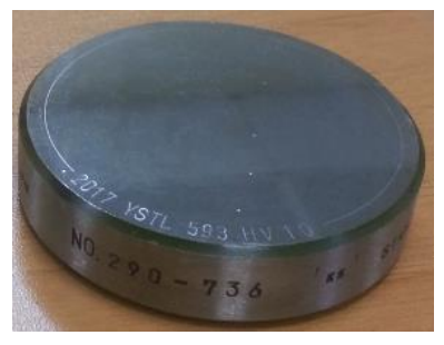
S/N: 290-736, 570 HBW2,5/187,5