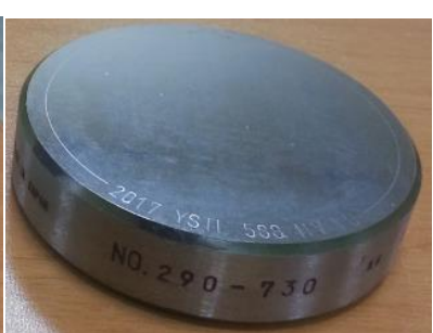
S/N: 290-730, 565 HBW1/30