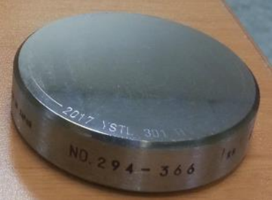
S/N: 294-366, 305 HBW1/30