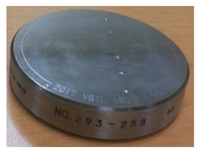
S/N: 293-258, 165 HBW2,5/187,5