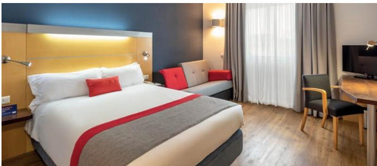
LEGENDARY LISBOA SUITES ***