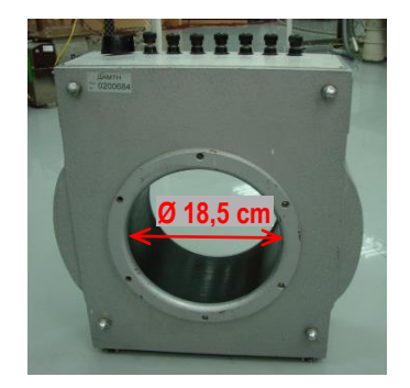
Fig. 1. Travelling standard