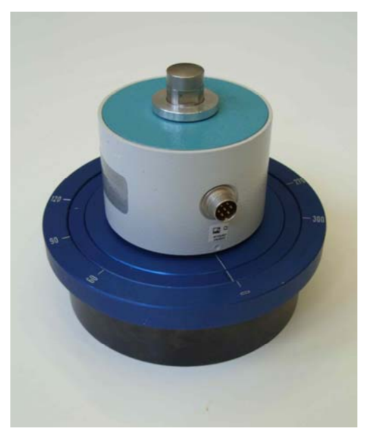
Fig. 2: Force transducer mounted on the auxiliary plate