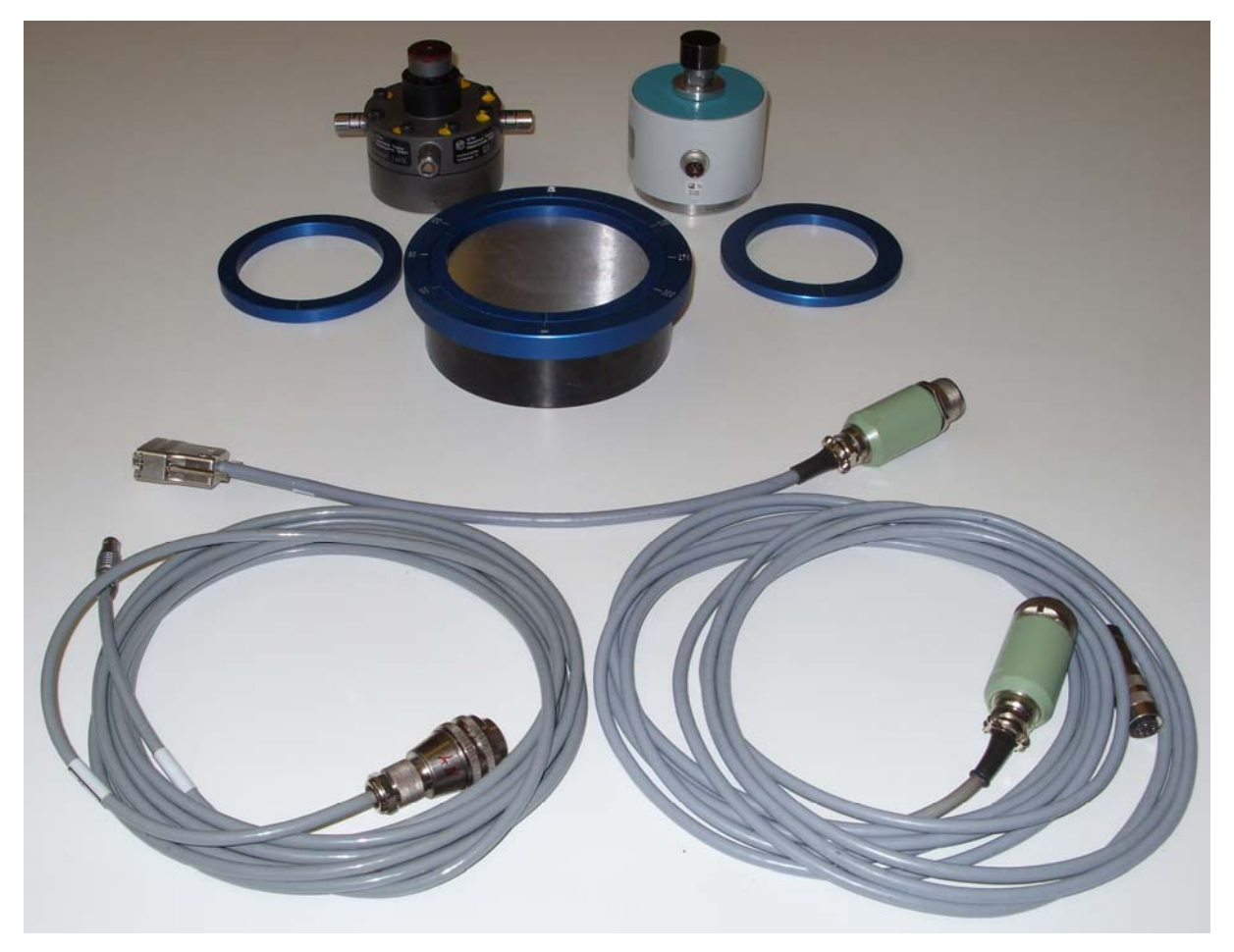
Fig. 1: Force transducers and accessories