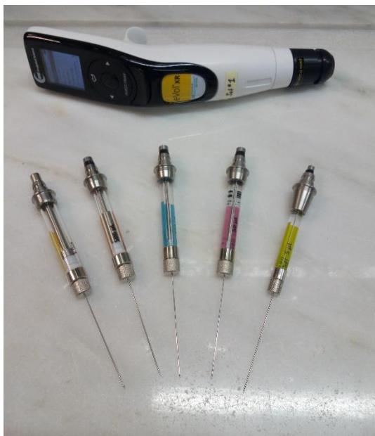
Figure 1 – Motor eVolvr and removable glass syringes