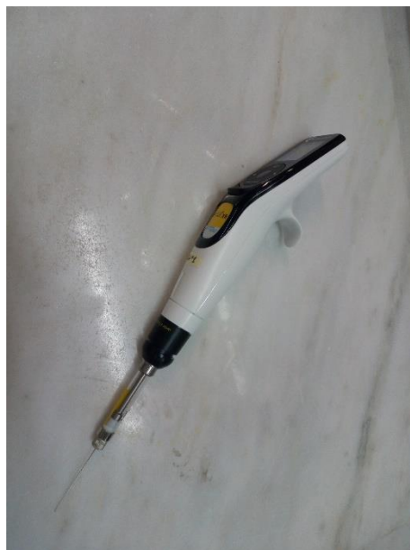
Figure 2– Syringe assembly