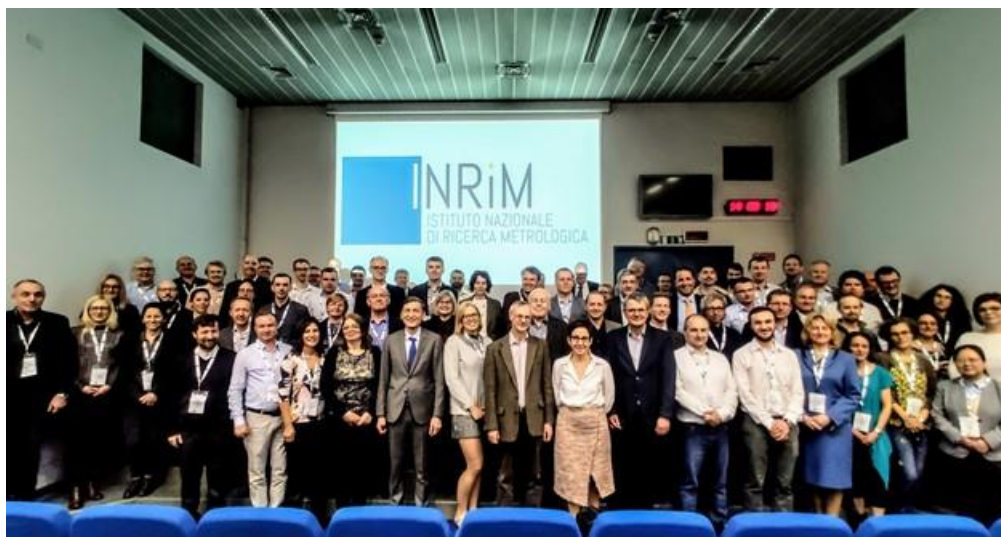
2019 TC-T meeting Group Photograph

The TC-T and SC-H count on 35 and 18 contact persons respectively.