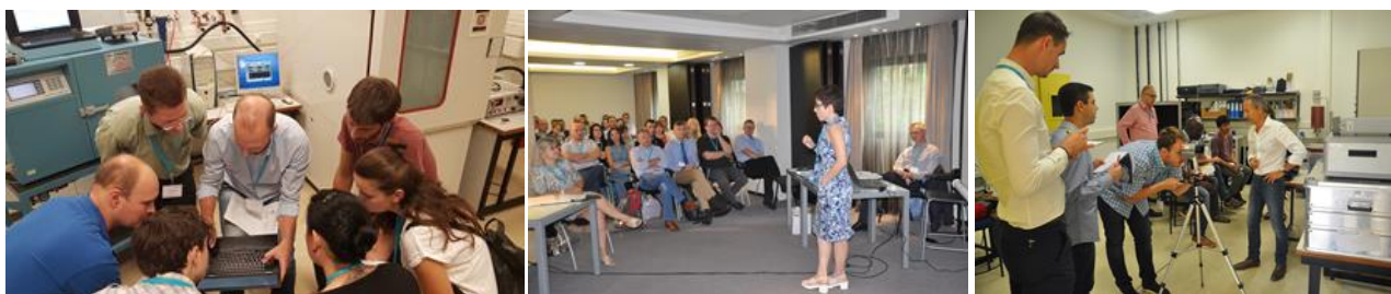
The EURAMET Summer School on Thermal Metrology