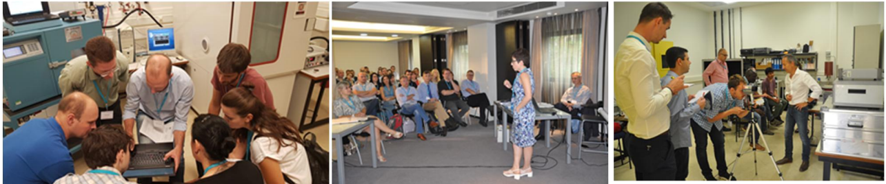
The EURAMET Summer School on Thermal Metrology