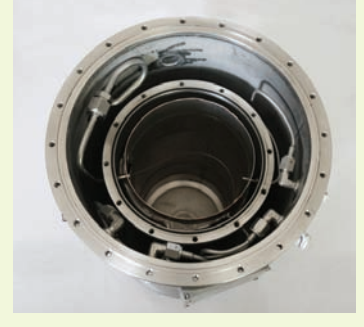
The MeteoMet automatic weather stations calibration chamber will be installed in the Everest Pyramid laboratory at 5050 m of altitude.