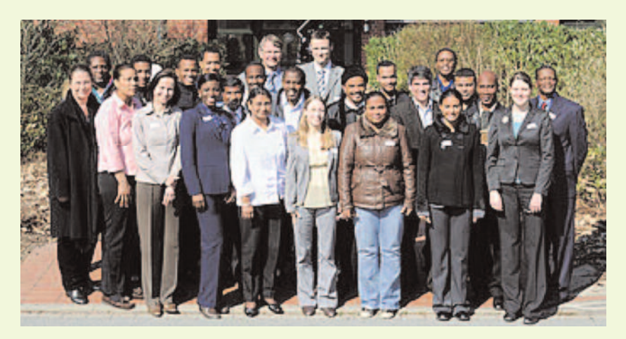
Caribbean NBS participants at the Training Programme

Further information is available from the EURAMET website under 'Latest News'.