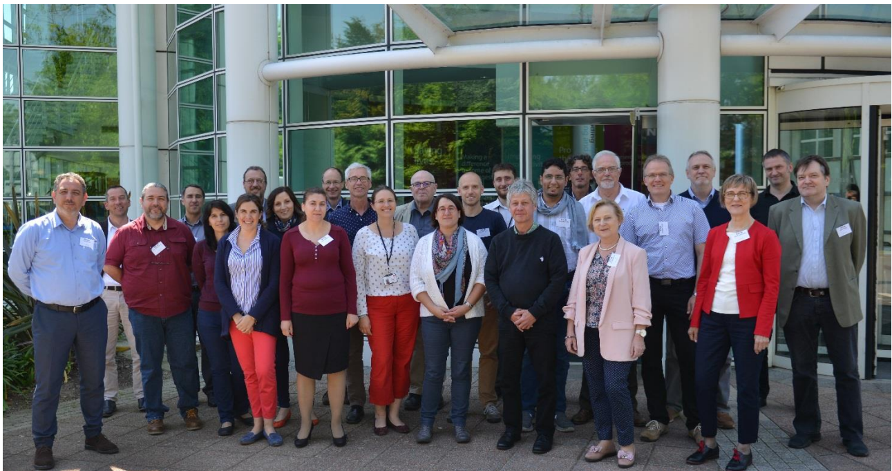
Delegates at the 2018 TC-AUV meeting at NPL, UK on 14 th – 15 th May 2018

The 2018 meetings were held at NPL, UK on 14 th – 15 th May 2018 and followed the now well-established 2-day format consisting of Plenary and Sub-committee sessions.