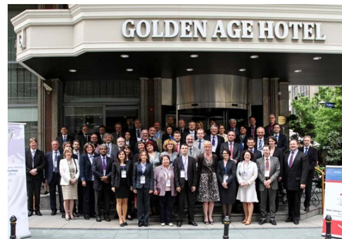
29th WELMEC Committee Meeting 13-14 May, Istanbul Turkey